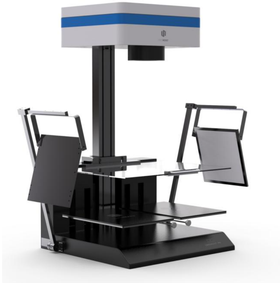
A2+ professional high-speed book scanner