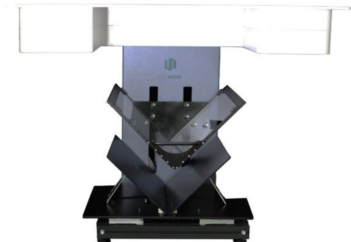
A2+ V-Shaped professional high-speed book scanner