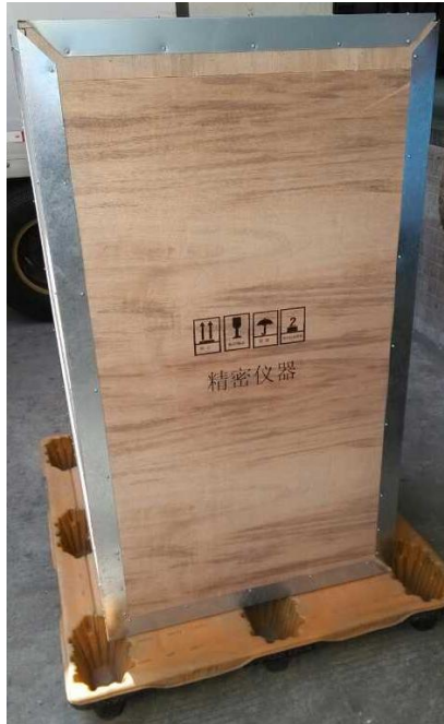
Crate packing (Just reference)